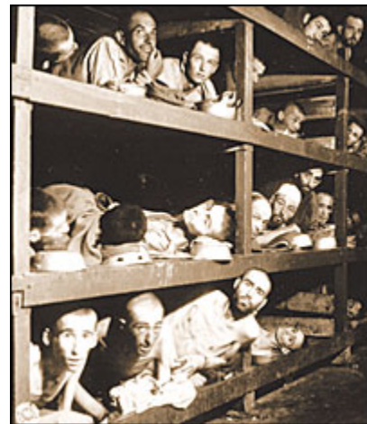
The results of Darwin's theories?

"He thought the Aryans were the fittest and he was just hurrying natural selection along," Coulter said.