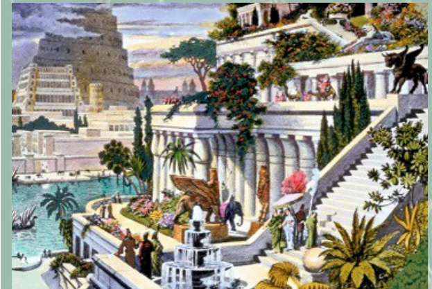
Hanging Gardens of Babylon