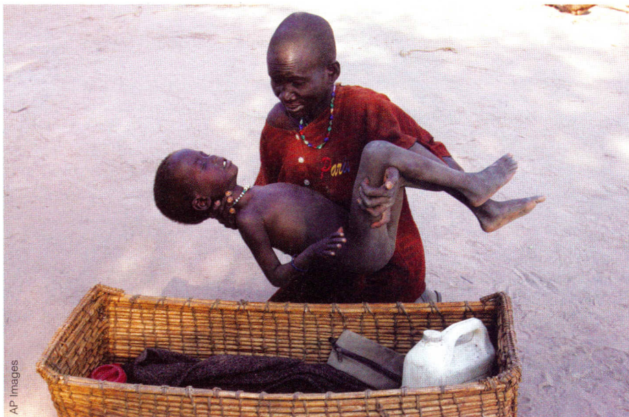
Snapshot of an agenda: Environmental groups, working in tandem with the UN, have made it difficult for Africans to get or have the political willingness to use the insecticide DDT. The policy has resulted in nearly a million malaria deaths a year.