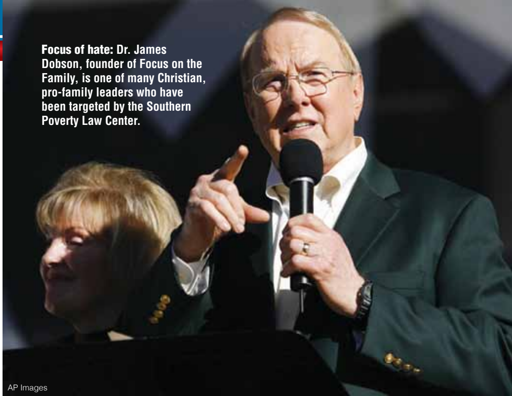
Focus of hate: Dr. James Dobson, founder of Focus on the Family, is one of many Christian, pro-family leaders who have been targeted by the Southern Poverty Law Center.

Do her charges hold? Is the SPLC “shutting down free speech in a very dangerous way,” specifically targeting “conservatives and Christians” and maliciously smearing them with the “racist,” “bigot,” “extremist,” “hater,” “anti-Semitic” — and even “terrorist” — labels? These charges are fairly easy to verify; simply go to the Southern Poverty Law Center’s website ( www.splcenter.org ), pick up one of its Intelligence Reports , or catch one of its spokespersons on CNN, NPR, CBS, or MSNBC. One will discover that Dr. Swain is far from being the only unlikely suspect to be viciously traduced with one or more of the SPLC’s hate labels.