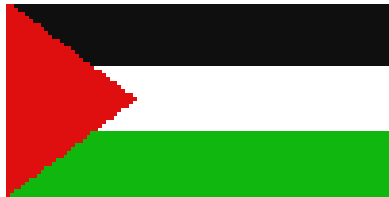
The Palestinian Flag

The Middle East will never have peace until this question is honestly answered according to the historical facts. Myths and legends are fine as children's stories, but in the real world we must have facts and documentation.