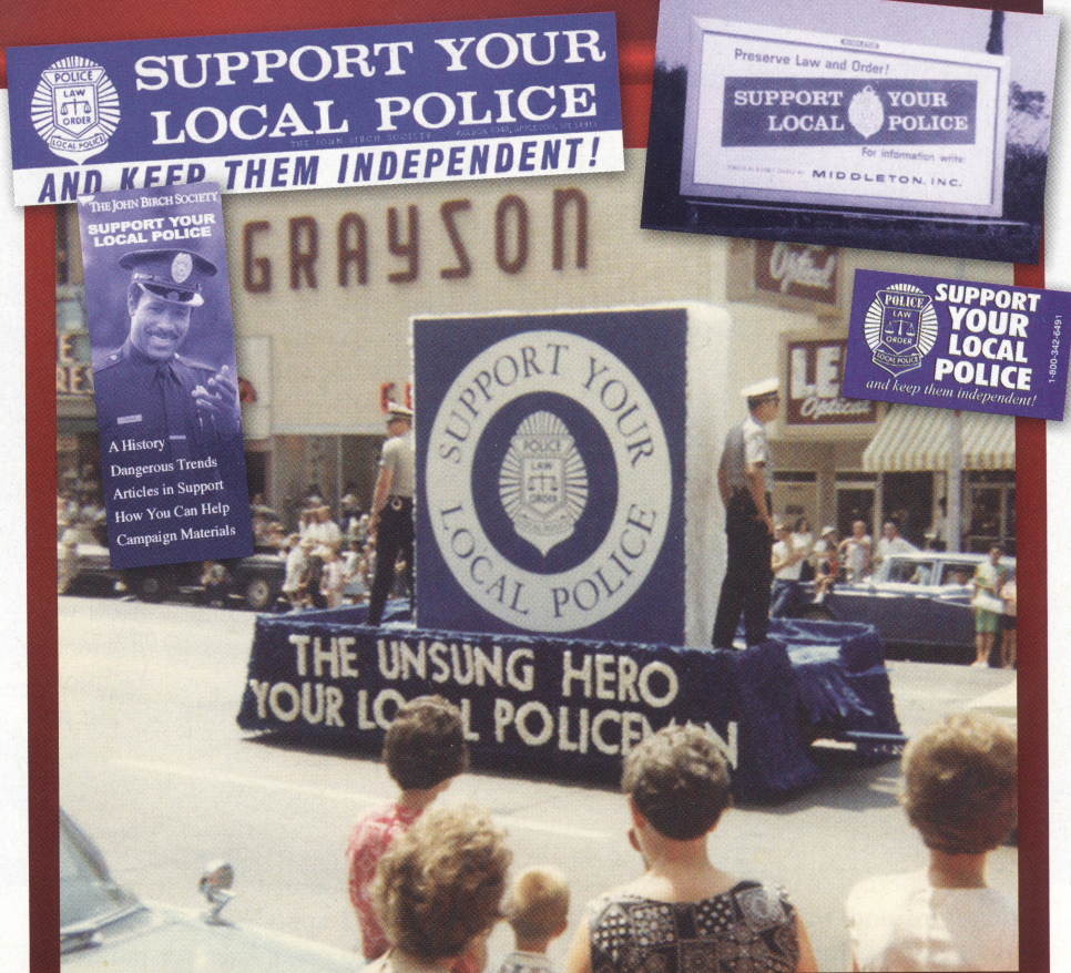
SYLP: The John Birch Society coined the term, “Support Your Local Police,” and launched a national network of SYLP committees in 1963. For more than four decades, it has campaigned against nationalization of local police.

However, that has not stopped liberal-left critics from falsely accusing the Society of these things. In so doing these critics have adopted the tactics developed