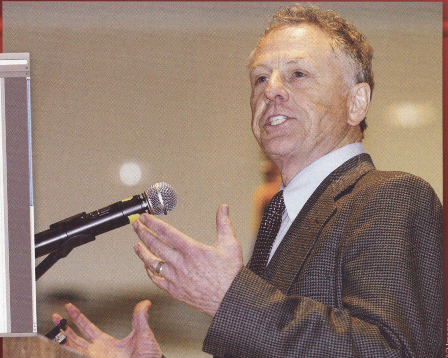
Spreading hate: SPLC founder Morris Dees (right) has grown rich as the “archsalesman of hatemongering,” falsely linking Christian, conservative, pro-life, and pro-family groups to the KKK and other extremists.

of Liberty Counsel, writes (in “Southern Poverty Law Center Officially Declared ‘Left-Wing Hate Group’”) that, “like any bully, the SPLC only goes after those it believes it can push around.”